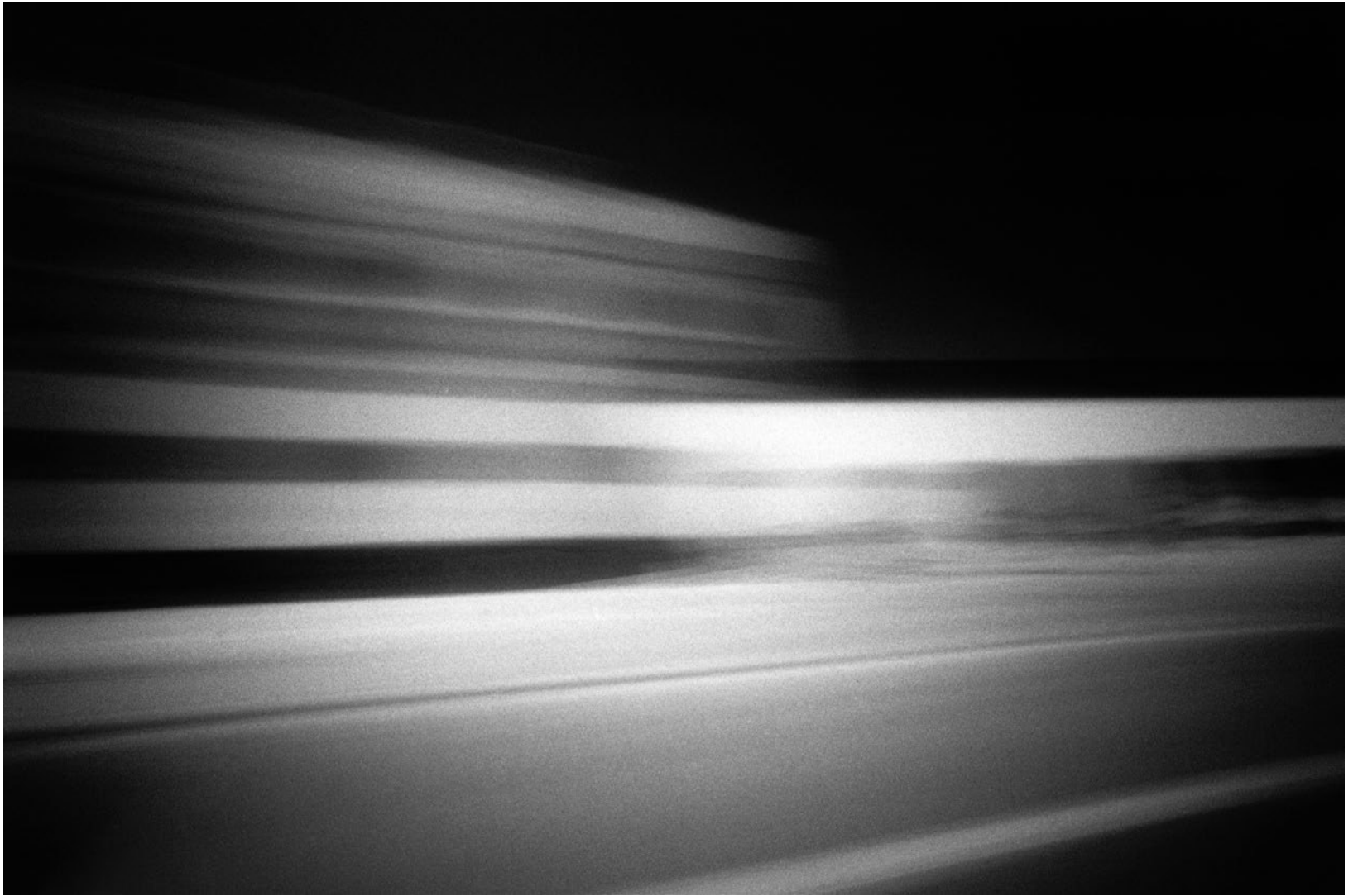
Marcus Schwier, Infrared – Night by Day, 2001