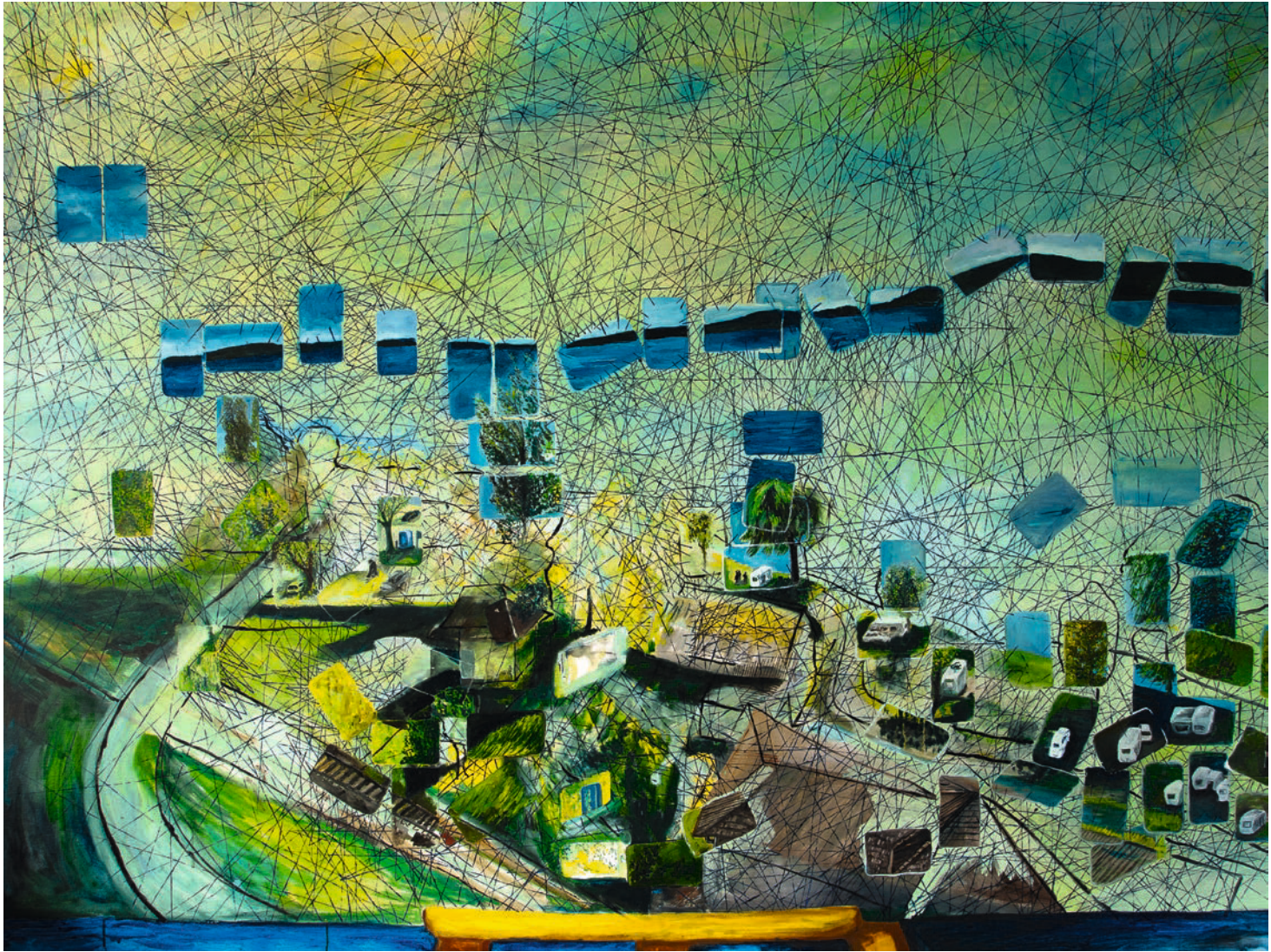
Renata Jaworska, Bodensee, 2014, 160 x 220 cm, oil on canvas