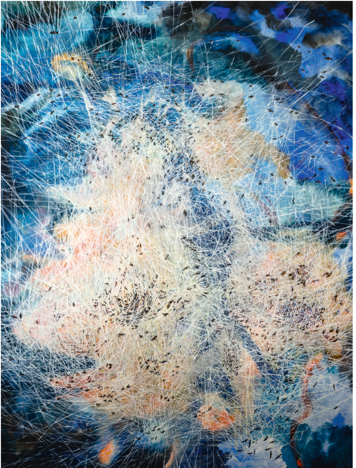
Renata Jaworska, untitled, 2013, 220×160 cm, oil on canvas