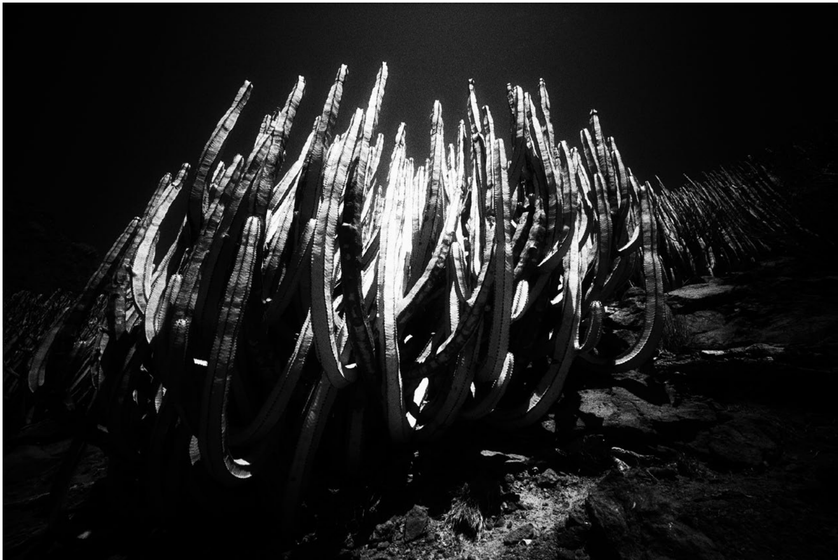
Marcus Schwier, Infrared – Night by Day, 2001